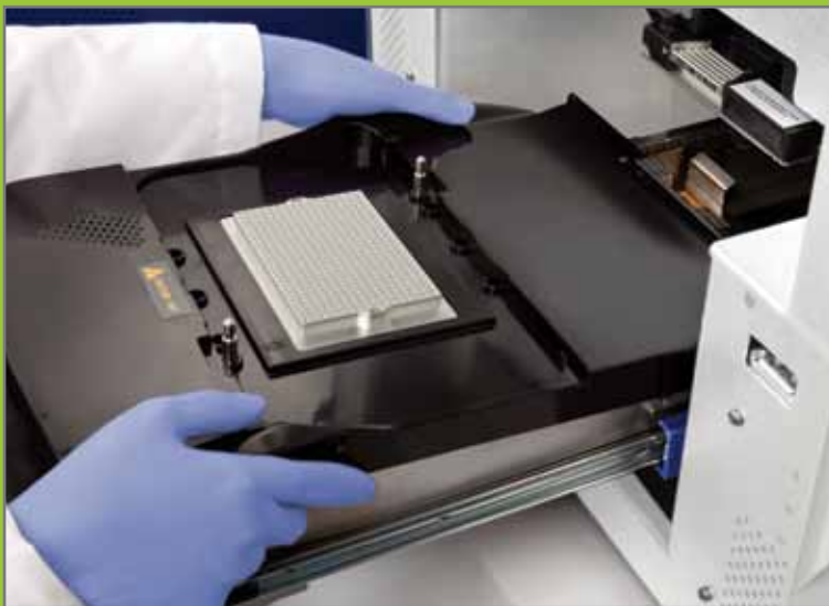
Front Access Allows Easy Block Change.