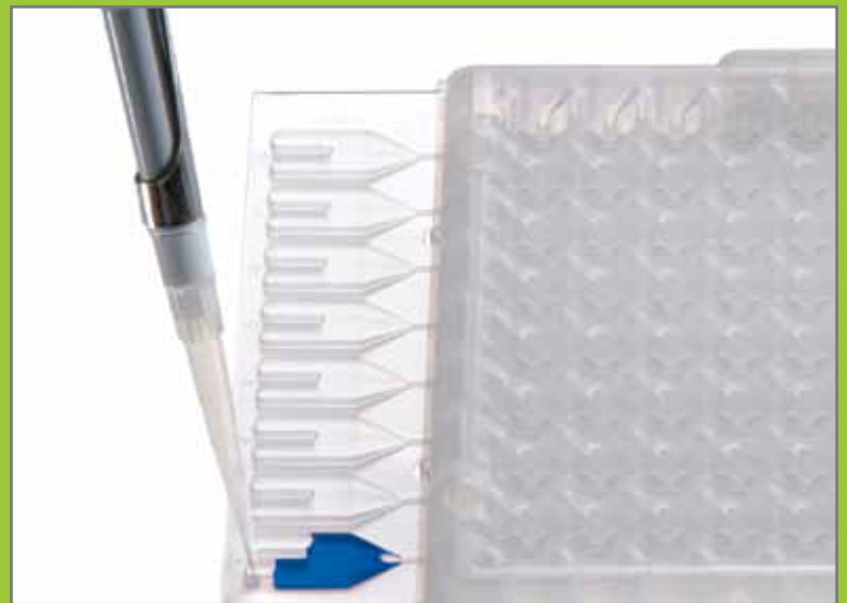
TaqMan® Array Micro Fluidic Card. Streamlines reaction setup time, does not require liquid-handling robotics, and provides standardization when screening selected panels of genes.