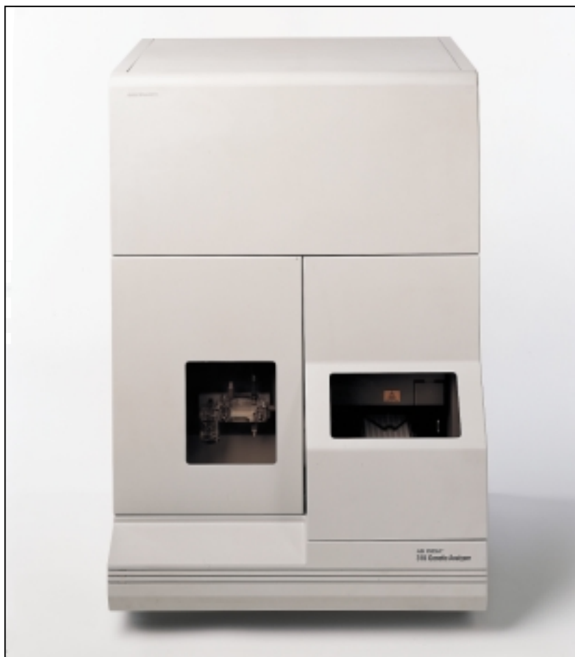
The ABI PRISM® 310 Genetic Analyzer is an automated system for sequencing, sizing, and quantitating nucleic acids. The system achieves unparalleled ease of use through the integration of ABI PRISM® multicolor fluorescent labeling, capillary electrophoresis (CE), and software for data analysis.

Simply install the capillary, load the gel pump with polymer, place your samples in the autosampler tray, and instrument setup is complete.